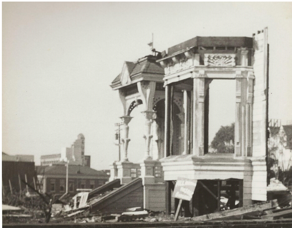
Demolition circa 1954. Notice the Eureka Theater and Carnegie Library in the background.